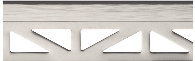
pro-part moon line