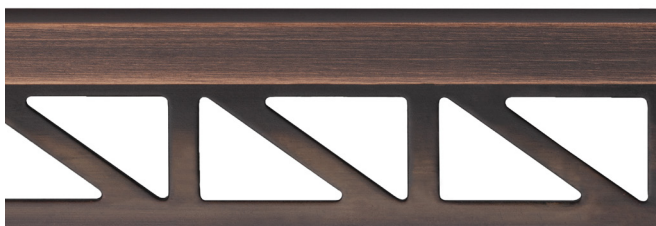
pro-part old bronze