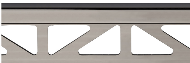
pro-part graphite matt