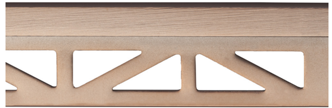
pro-part rose line