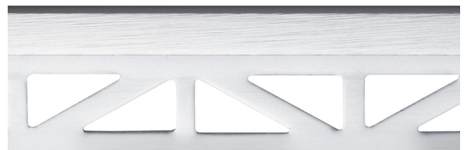
pro-part ocean line