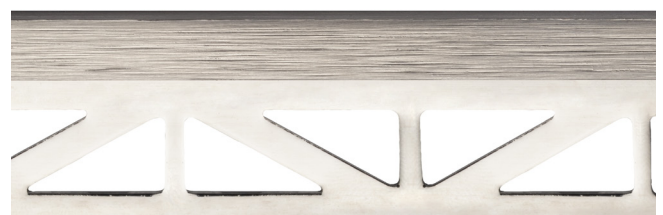
pro-part line matt