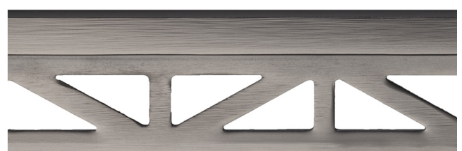
pro-part graphite matt line