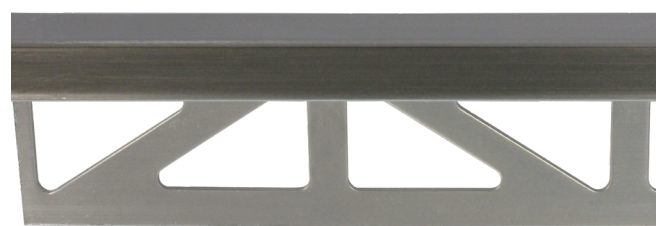
pro-part old iron